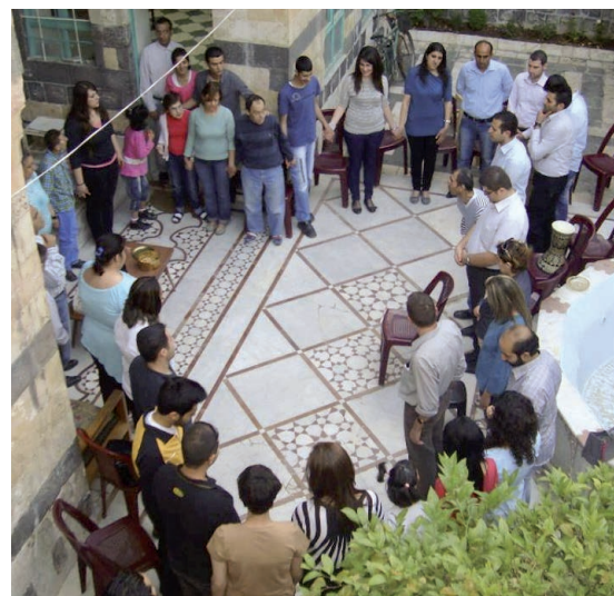
Community L'Arche Al-Safina Day of fasting and prayer for peace in Syria

G od is thirsty for unity, he longs to bring together all the children of God who have been dispersed. He longs to break down the walls which separate us from each other, so that life can spring forth. God weeps before division. God wants us to celebrate unity, and to work humbly and poorly for unity. This God is so hidden behind all the noise and the stresses of our societies. He is there, He waits, He waits for an encounter, He waits for me, He waits for each of us. Let us pray together for our world in pain.