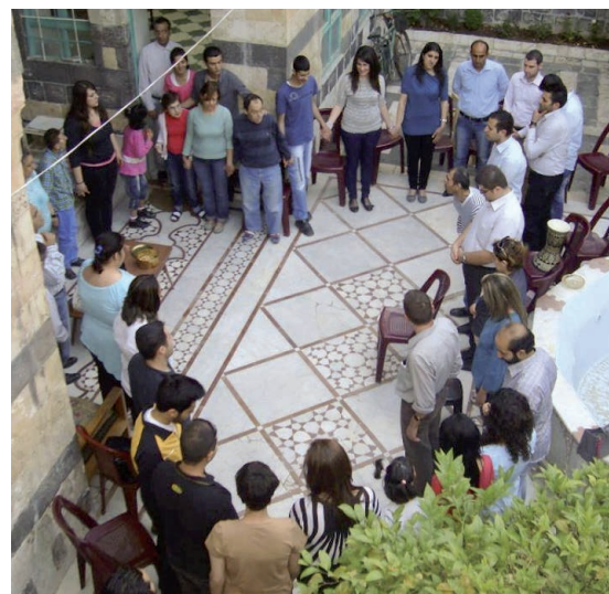
Community L'Arche Al-Safina Day of fasting and prayer for peace in Syria

G od is thirsty for unity, he longs to bring together all the children of God who have been dispersed. He longs to break down the walls which separate us from each other, so that life can spring forth. God weeps before division. God wants us to celebrate unity, and to work humbly and poorly for unity. This God is so hidden behind all the noise and the stresses of our societies. He is there, He waits, He waits for an encounter, He waits for me, He waits for each of us. Let us pray together for our world in pain.